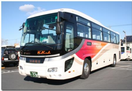
TYPE HIGH - DECKER