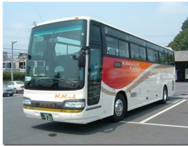
TYPE SUPER HIGH - DECKER