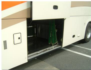
A large-sized trunk room