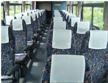
40 seats of seating